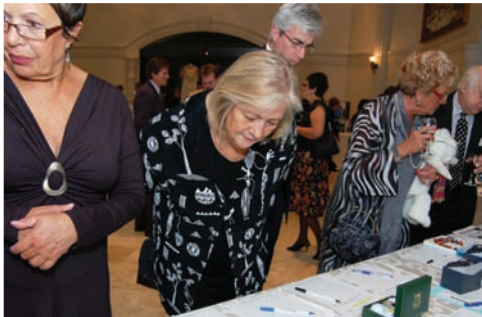
The Gala Silent Auction table attracted lots of attention.

charities that make a difference in the lives of young Canadians has had a huge impact on the success of Safehaven's major fundraiser, our Gala.