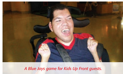
A Blue Jays game for Kids Up Front guests.

In 2008 Kids Up Front distributed an amazing total of 21,884 experiences to their partner agencies (currently 107). The total value of these experiences is $634,059.