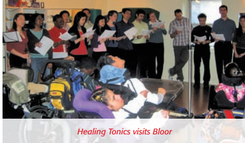
Healing Tonics visits Bloor

and children from all our houses joined us for a wonderful hour long program of jazz standards, Broadway, Disney and international selections – with clap along and some sing along selections included! The children responded by smiling and nodding to the music and the warmth and energy of the students in the choir. Everyone enjoyed the potluck dinner afterwards which allowed the choir to mingle with staff and children.