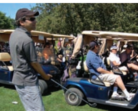
And they're off!