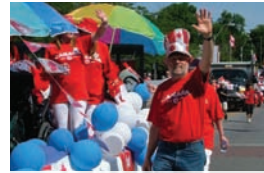
Saf haven family members join Aurora residents in the parade