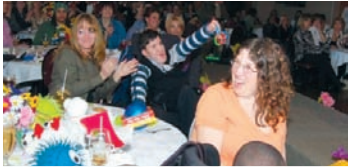
Staff and residents from Aurora had an amazing time at the Flower Power Fashion Show.