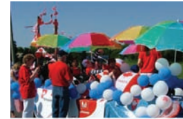
Aurora decorates Saf haven's Canada Day.

Watch for Saf haven Aurora in this year's parade. We're very excited about taking part again! We know this year will be a great success.